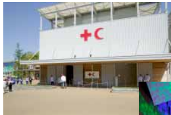
International Red Cross & Red Crescent Movement