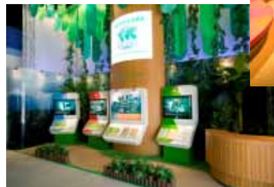
International Tropical Timber Organization