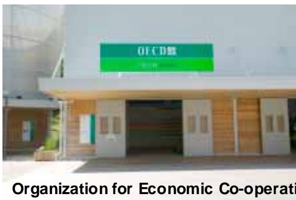
Organization for Economic Co-operation and Development