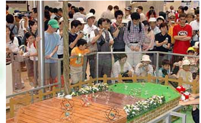
Visitors watch the robots

6/11 Pearl Anniversary at the Expo 26 couples celebrate their thirtieth wedding anniversary