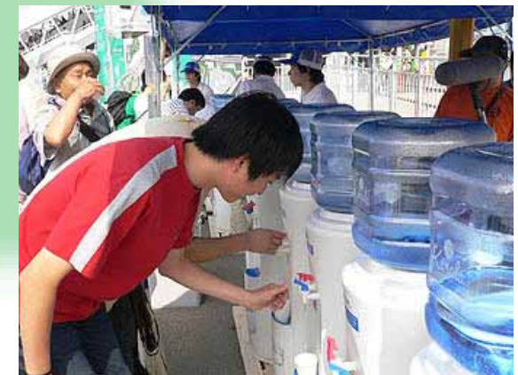
People helping themselves to water

6/18 New single-day record: Over 170,000 visitors Previous record shattered