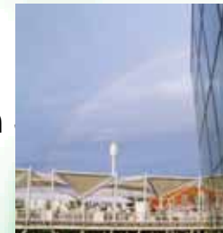
Typhoon No. 7

7/26 Visit by Prince and Princess Hitachi (through 7/26 Typhoon No. 7 approaches with no trouble at the venue