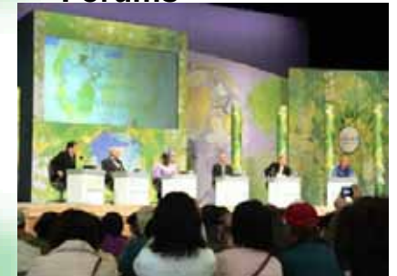
Expo 2005 International Forums

3/27 French President Jacques Chirac visits Expo 2005