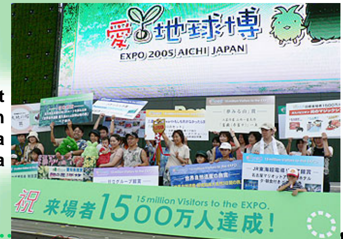
Event commemorating 15 million visitors at the Expo Plaza

8/8 Nagoya Week begins (through August 14) A special Expo version of the Middle of Japan Festival, a summer rite in Nagoya