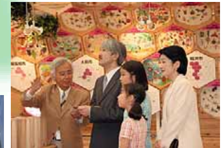
The family of Prince Akishino listening to an explanation inside Aichi Pavilion Seto

7/25 Visit by Prince and Princess Akishino and their daughters, Princess Mako and Princess Kako