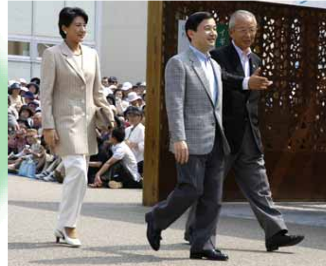
The Crown Prince and Crown Princess entering the Pavilion of the United Kingdom

7/20 Seto Area opening hours 9:00 – 19:00 (through August 31)