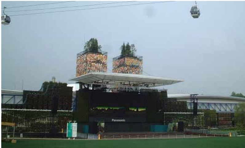
The overall view from the Expo Plaza

(3) Displayed overview : See photos below