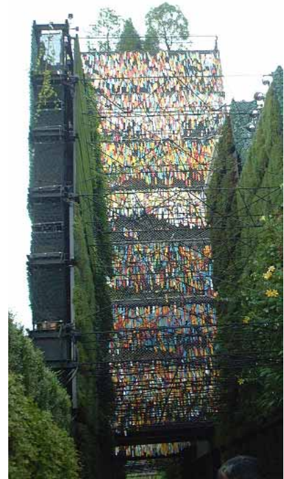
The side view from Bio Lung corridor