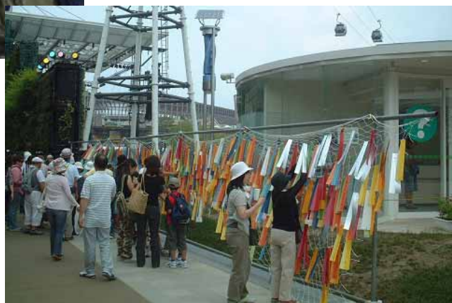
2. Attach the strips of paper to the nets with paper strings