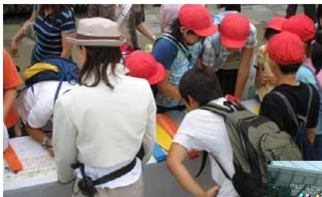
1. Writing wishes on the coloured strips of paper