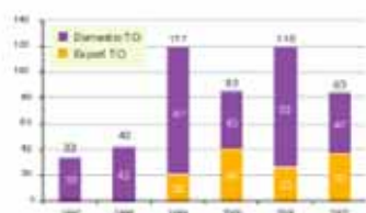
Domestic and Export Turnover of Computer Services and Engineering Companies