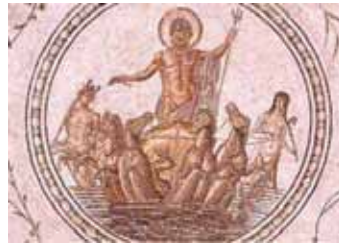
Sousse, the 3rd age. Of portrait Room, the scenes

Tunisia has the finest collection of mosaics in the world and the majority of these can be seen at the Bardo Museum. This Moorish palace in the suburbs of Tunis was, at one time, the residence of Tunisia's Beys (kings), and besides housing the fabulous exposition of mosaics, it contains an important collection of Prehistoric, Roman, Punic and Islamic artifacts. Classified by region, Carthage, Dougga, Bulla Regia mosaics date mostly from the 3rd and 4th century - their golden particular interest is the unique of Virgil, and in the Sousse the Triumph of Neptune, one of the largest in existence. Realistic of hunting, a panorama of mythological gods and goddesses, exquisite still lifes of fish and games, the legendary Hercules and the adventurous Odysseus are portrayed with astonishing mastery of form and color. What marvelous skill it was of these unknown artists who used tiny chips of stone to create such beauty! Come to Tunisian Pavilion and see some significant samples of this fabulous heritage.